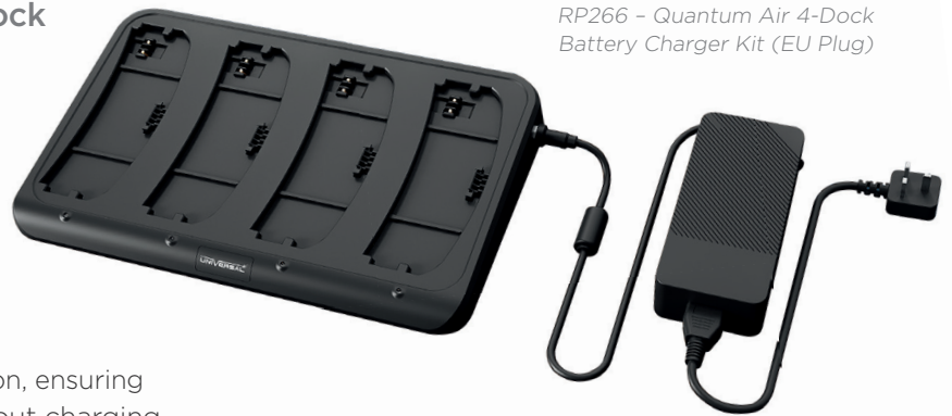
RP265 - Quantum Air 4-Dock Battery Charger Kit (UK Plug)

Prevents cable clutter and streamlines the charging of multiple batteries. Convenient management and maintenance made easy.